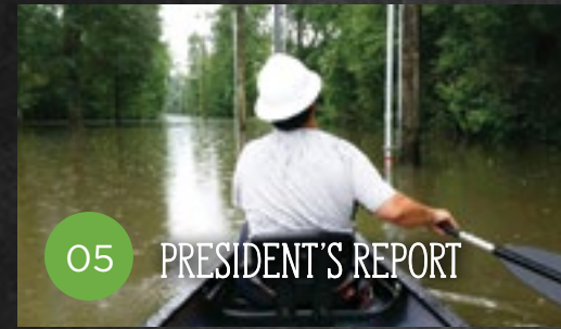
05 PRESIDENT'S REPORT