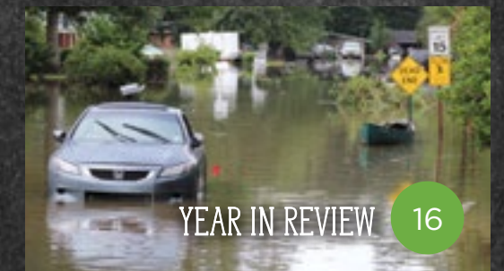
YEAR IN REVIEW 16