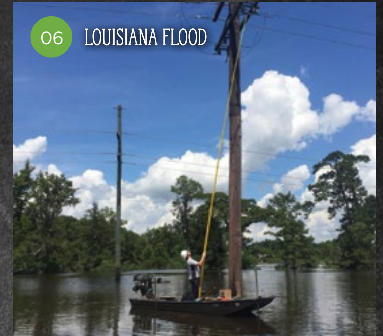
06 LOUISIANA FLOOD