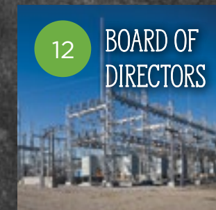
12 BOARD OF DIRECTORS