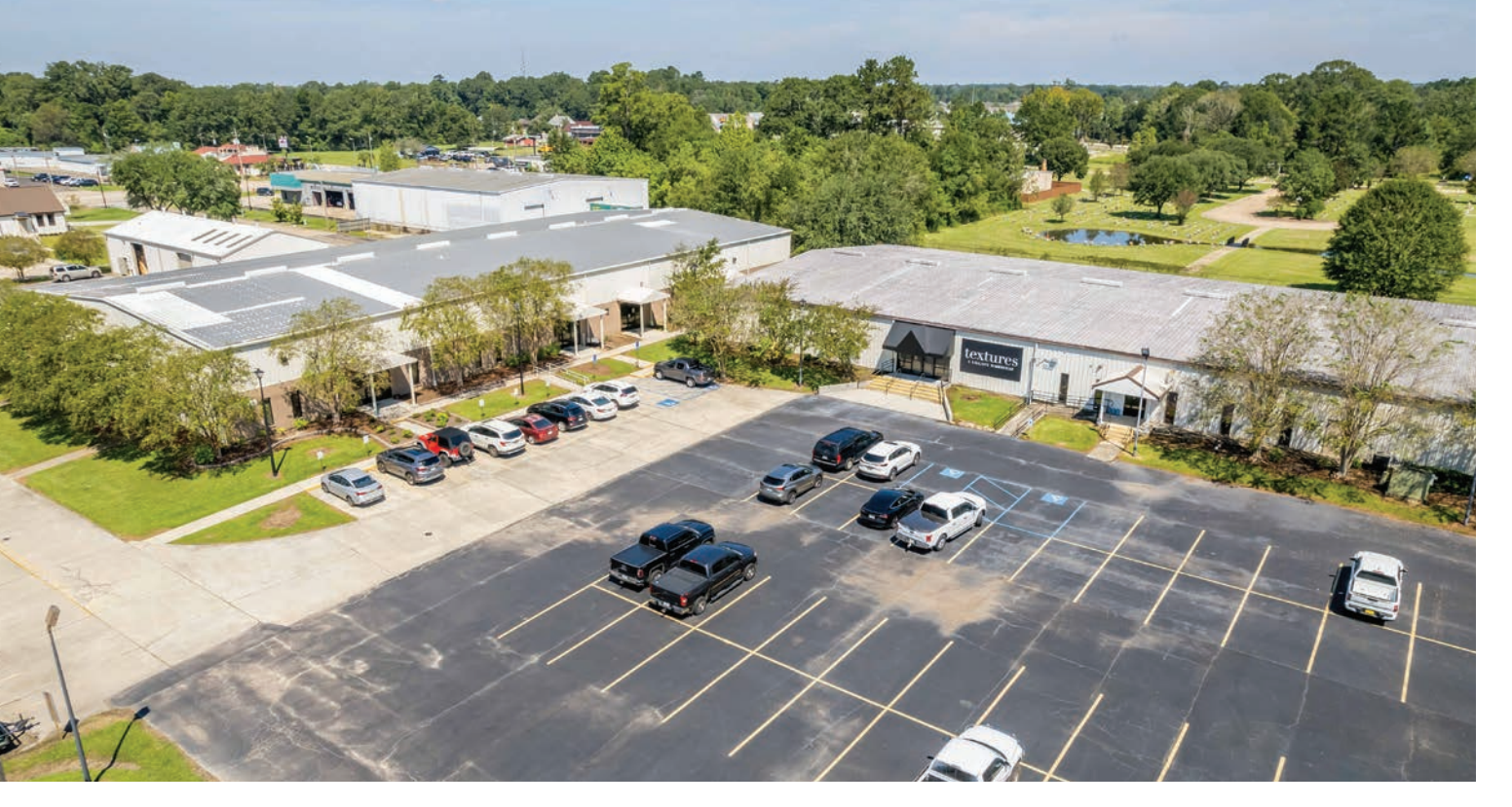
Dixie Business Development Center business incubator started in 1992 with 8,000 square feet and grew to a total 50,000 square feet. Clients can take advantage of office space and shared business services at below-market rates to get a jump start in business.