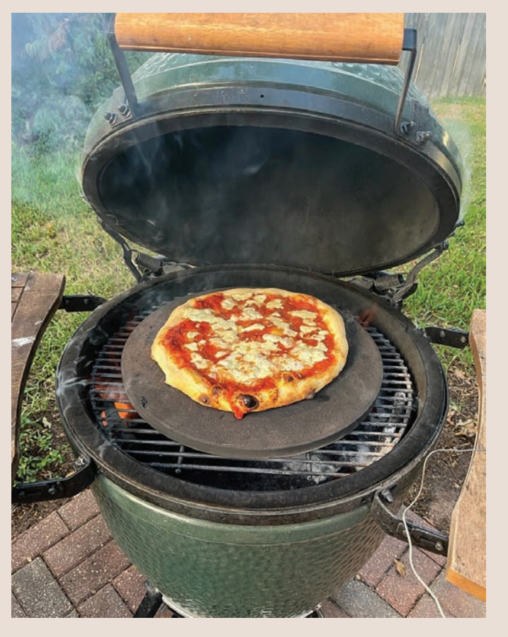
A pizza is ready to remove from the grill.

"I'm lucky because I get to do what I love to do," Jeffro says. "It's better than being covered in jet fuel." ■