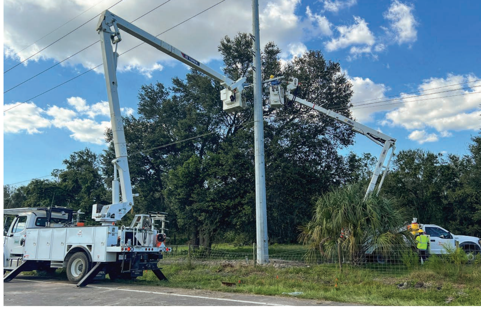
Lineworkers from Beauregard Electric Cooperative, left, and SLECA work together during power restoration following Hurricane Ian.