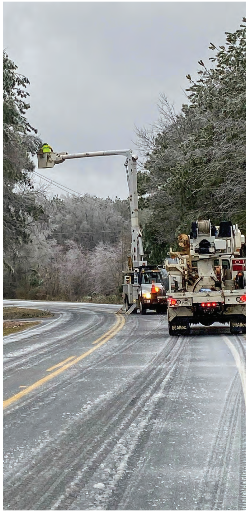
More than 100,000 power outages were reported throughout South Carolina on January 16 following Winter Storm Izzy. Cooperative crews descended on the region to help repair lines and restore electricity.