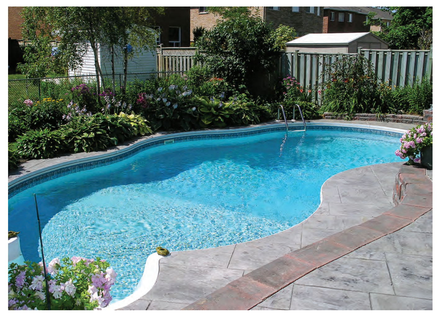
Reduce your pump's filtration run time to save money on your power bill without sacrificing pool cleanliness.