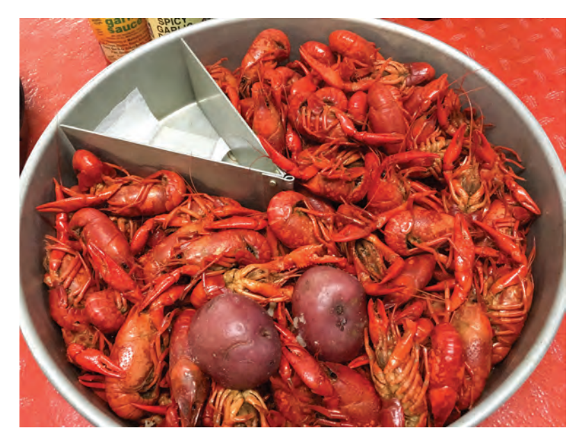
This crawfish platter shows Cajun ingenuity, with a moveable section where diners can place their spent crawfish shells as they work their way through the meal.