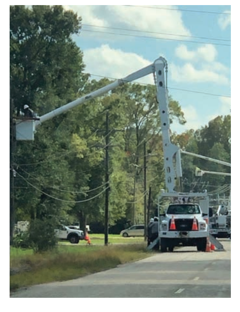
ABOVE: DEMCO crews and contractors work to restore power to consumermembers following Hurricane Delta.

Delta-related outages peaked at almost 42,000 early Saturday morning,