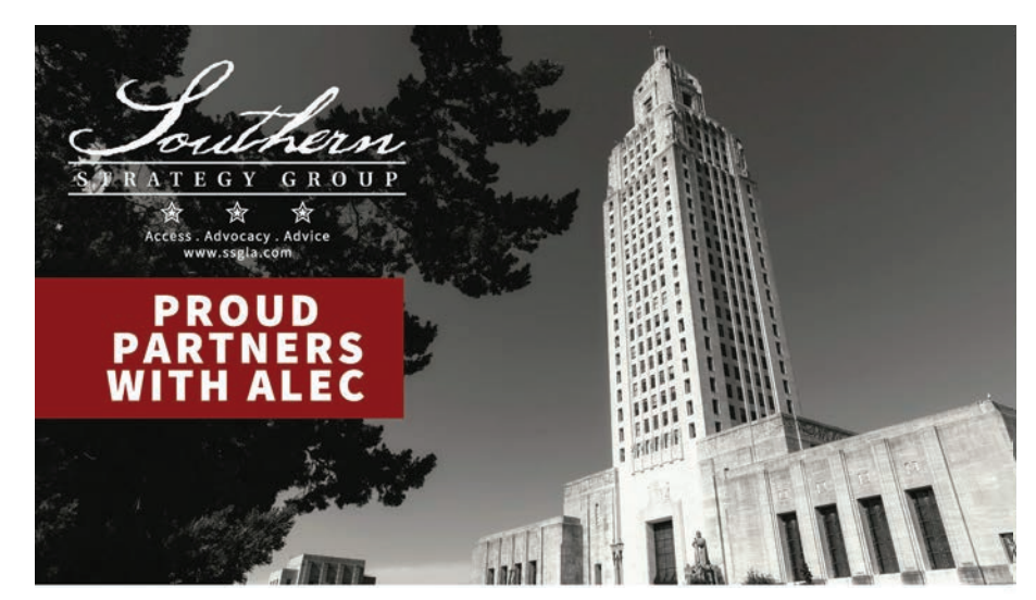
We understand the politics of business and the business of politics.

02010 ALSAC/St. Jude Children's Research Houstell (8466778)