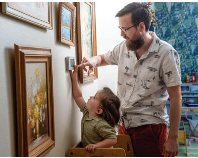
Include your children in discussions about what temperature to set the thermostat to balance comfort with energy savings.

To find household appliance wattage, look for the amount